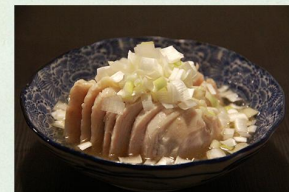
Boiled chicken with Special sauce of Salt.