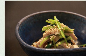
Boiled chicken with Japanese honewort and Japanese pepper.