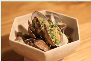
Sake-steamed Short-necked Clams