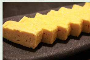
Japanese rolled omelette SALTY/SWEETY