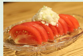
Sliced Tomato with Garlic Sauce.