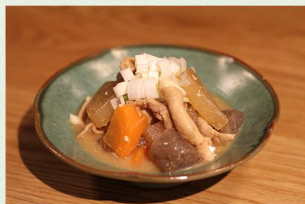
Pork Guts Stew